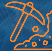
Mining and Metalmechanics