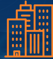
Infrastructure and urbanism